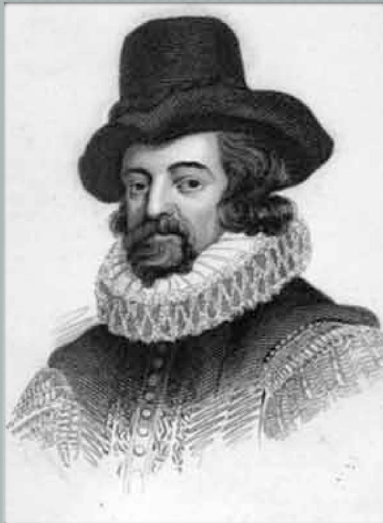
Francis Bacon 1561-1626