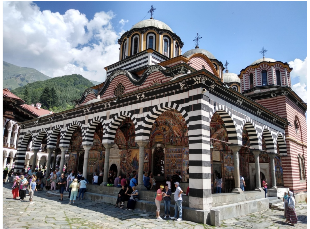
St. John of Rila (876-c.946)